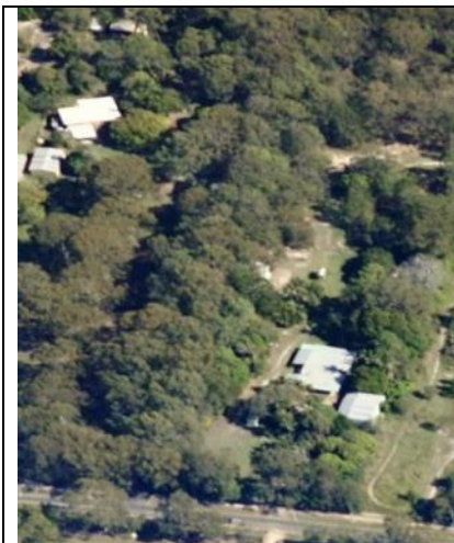
Corner of Kinsellas Road West and Hamilton Rd