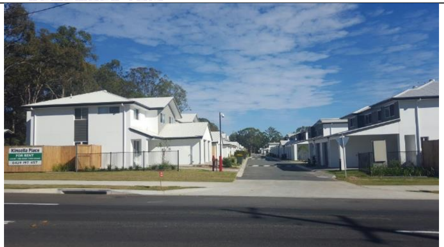
What a difference just two years make.

Left: Mackenzie land in May 2014 - Above: Kinsellas Apartments open May 2016