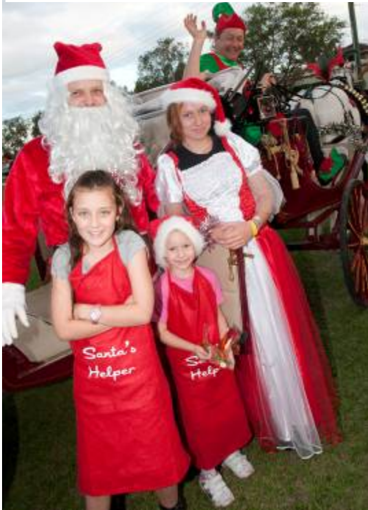
Some of 15 Hampers donated by Residents