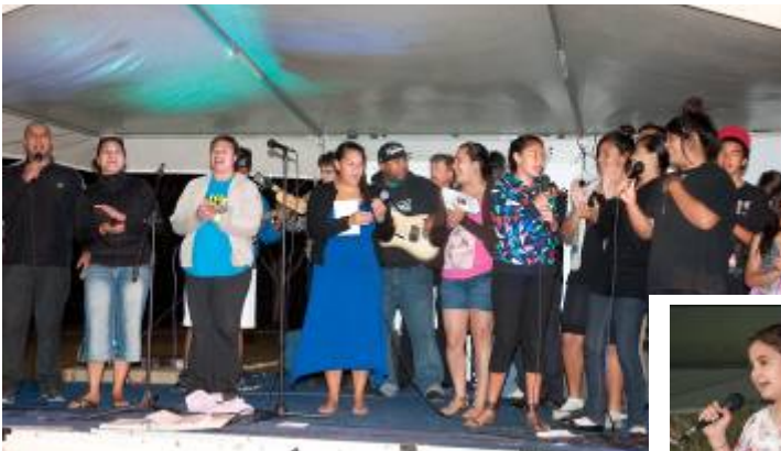
New Life Adventist Church on stage with the Message of Christmas.