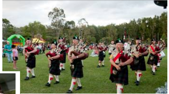
Above: National Services Pipes and Drums enter the arena.