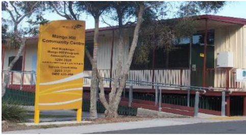
(Chermside Rd, Mango Hill Village)

Mango Hill Village Hall Directory Hall Hire: (Laurence 3204-2020) Bookings via admin@mangohillprogress.org